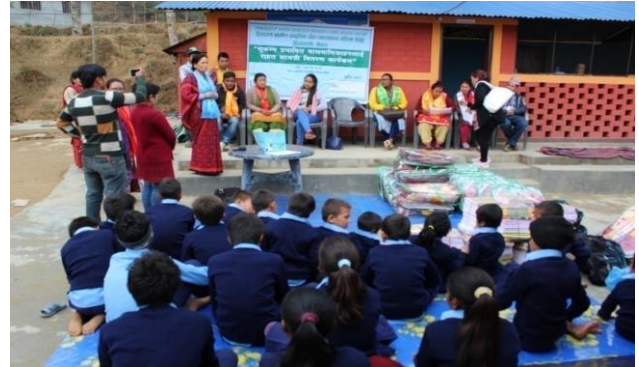
Photos: Earthquake relief package distribution to the children