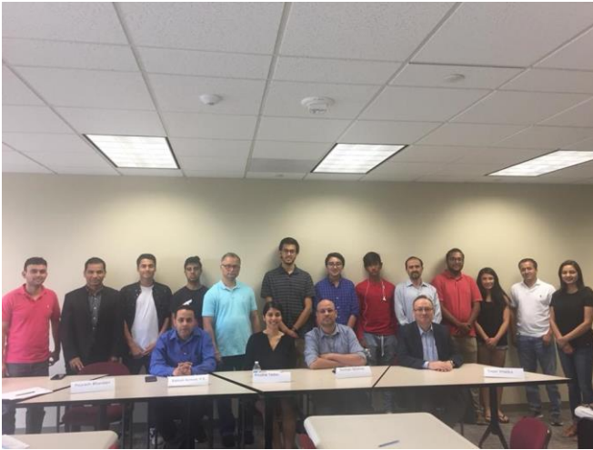
Photo: Group picture of participants and panelists

There were five Panelists who shared their education, work experiences, career goals, if they had any family pressure during their school/college, and their stories on how they got where they are now and the future ambitions. This helped student audience to share their own educational/career interests and stories. This type of events will promote our young generations to come forward, share their knowledge, ideas, experiences and expand their professional network.