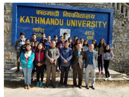
Photo: Presentation to Kathmandu University Architectural Students specializing in Mountain Architecture, Dhulikhel, Nepal debates on development, heritage conservation and reconstruction after the 2015 Gorkha-Nepal Earthquake,