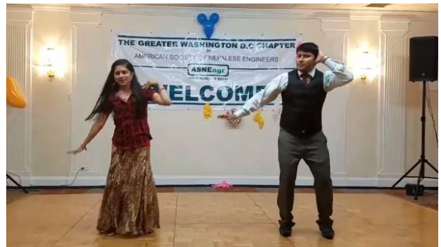
Photos: Engineer's Night 2018 fun activities