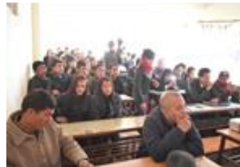
Photo: Scenes from Fire Safety Training at Greenfield National College, Kathmandu, Nepal