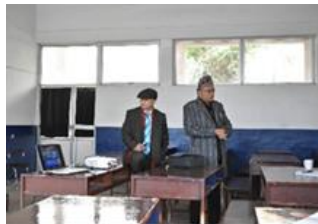
Photo: Presentation to Masters Students (Structural Engineering), Kathmandu University, Dhulikhel, Nepal

The debate in Nepal on heritage reconstruction, restoration and preservation is on-going. A presentation to discuss “Understanding Disability and Disabled Access in Heritage Public Venues” was made to young architectural and engineering professionals involved with the reconstruction of Kasthamandap.