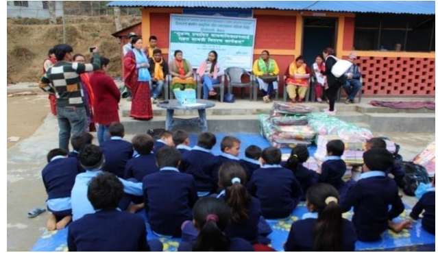
Photos: Earthquake relief package distribution to the children