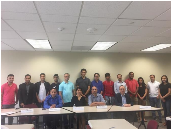
Photo: Group picture of participants and panelists

There were five Panelists who shared their education, work experiences, career goals, if they had any family pressure during their school/college, and their stories on how they got where they are now and the future ambitions. This helped student audience to share their own educational/career interests and stories. This type of events will promote our young generations to come forward, share their knowledge, ideas, experiences and expand their professional network.