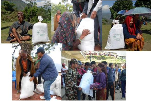
Distribution of relief materials in Gorkha by ISER-N

4. ASNEng has provided a financial assistance of $3,350 to Nepal Engineers' Association (NEA) to support the post-quake rapid assessment of buildings and infrastructure.