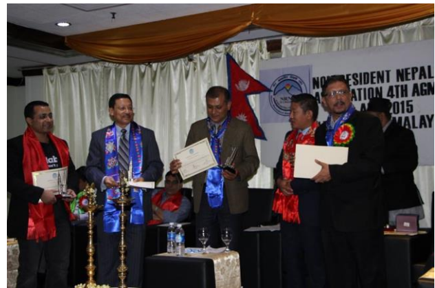
ASNEng President (second from left in the picture) during felicitation program