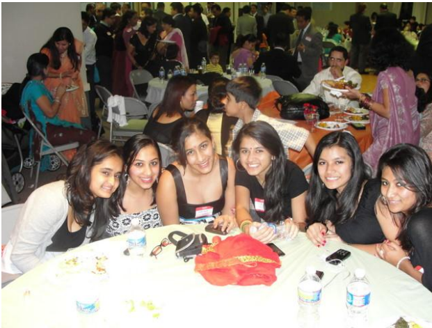
A scene from the Greater Washington D.C. Nepali Engineers' Night.