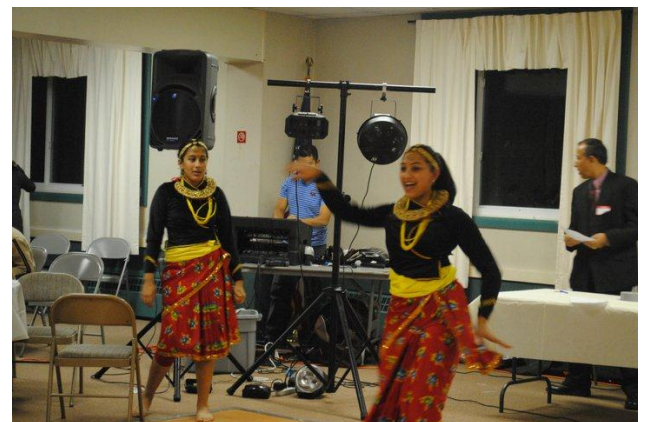
Nepali folk dance scene from the after dinner cultural program.