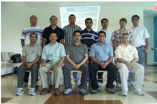
Houston Nepalese Engineers in the meeting on April 30, 2011