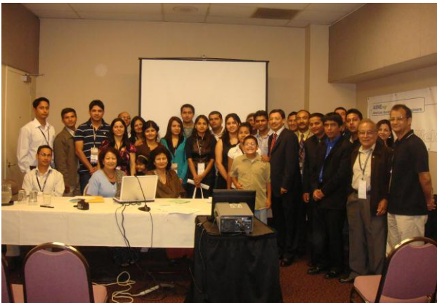
Some attendees at the ASNEng Annual Conference in Oakland, CA; July 03-04, 2009.

The second annual American Society of Nepalese Engineers (ASNEng) conference was held at Oakland Convention Center, Oakland, California over the July 4 th weekend of 2009 in conjunction with the Association of Nepalese in Americas (ANA) Convention. The theme of this conference was “Engineering and Science for Sustainable Development of the Society”. It provided a common venue for the engineers, scientists, and technical professionals to discuss and brainstorm a collaborative effort for further research and development. In addition to the general membership/BOD meeting, the conference included technical sessions and a panel discussion.